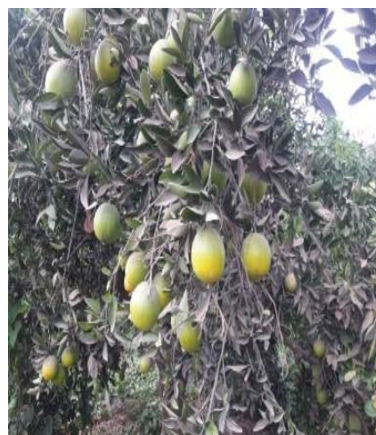
Fig. 1: Field Image for color break in W. Navel Orange in Egypt 2018

Washington navel orange: It is main cultivar navel orange in Egypt and it is the leading exportable fruit commodity of Egypt. It is the best-known navel orange, also, there are other navel orange cultivars like (New Hall, Navelina, Navelate, Lane Late, Cara Cara, Fisher, Fukumoto and Leng). The main production areas are Behera governorate (21030 ha), Qalyoubia governorate (11780 ha), Ismailia governorate about 7591 ha, Sharkia governorate (6877 ha), Menoufia governorate about 6426 ha and Nubaria district (5938 ha). Fruit color break start in September as shown in Fig. 1 and fruit mature from mid of October to March approximately, the fruit is seedless, medium to large sized, with relatively rough skin in some cultivar and soft skin in others, it has sweet flavor, fruit taste is luxurious, rind is orange with dark pulp.